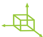
Battery sizing tool