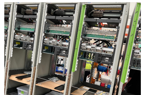
Installation & Commissioning