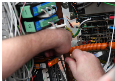
Integration & Testing