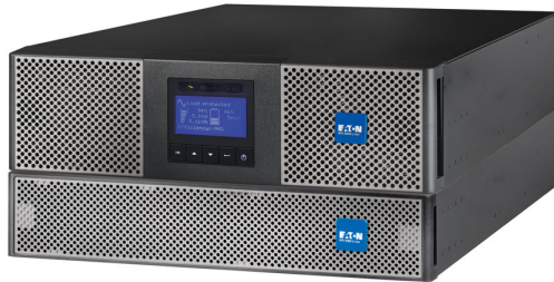
9PX 6kVA Li-ion